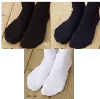
Socks – White, Black, Navy