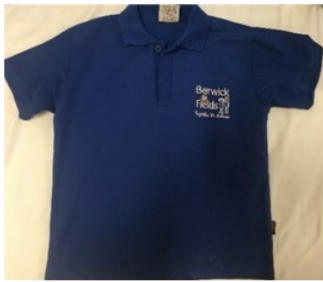
Polo Shirts Blue or White

The wearing of school uniform is compulsory at Berwick Fields Primary school. For our full uniform list, please see our Website or contact PSW- 407 Princes Hwy Officer- 03 9768 0382.