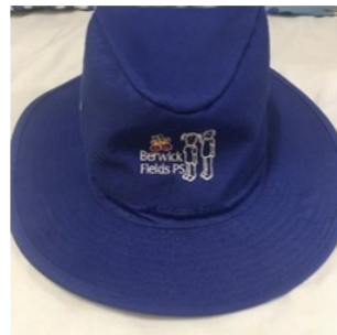
Blue Hat Compulsory from 1 September till 30 April