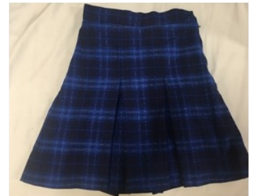
Winter Skirt (Tunic)