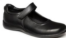
Sport Shoes or Black Shoes