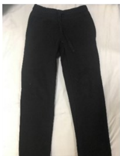
Black Pants No Jeans