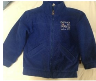
Polar Fleece Jacket